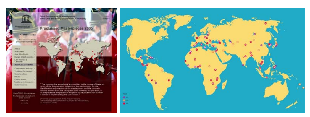
Figure 1: Unesco, Masterpieces of Oral and Intangibile Heritage<sup>3</sup>

The convention aims to raise awareness at the local, national and international levels, of the importance of the intangible cultural heritage, and to ensure the safeguard of it. Safeguarding of intangible cultural heritage means: "measures aimed at ensuring the viability of the intangible cultural heritage, including the identification, documentation, research, preservation, protection, promotion, enhancement, transmission through formal and non-formal education, as well as the revitalization of the various aspects of such heritage" (Article 2.3).