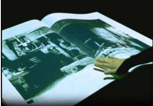
Figure 2: Museum of Resistance, Studio Azzurro (IT), 2000

In the design of this museum of such cultural value, dedicated to preserving and developing the historical memory of the Resistance movement under Fascist and Nazi domination, has been